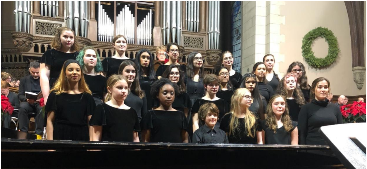
Our Treble Choir performed at Lessons & Carols on Sunday evening, December 8, 2019 to a packed and full chapel.