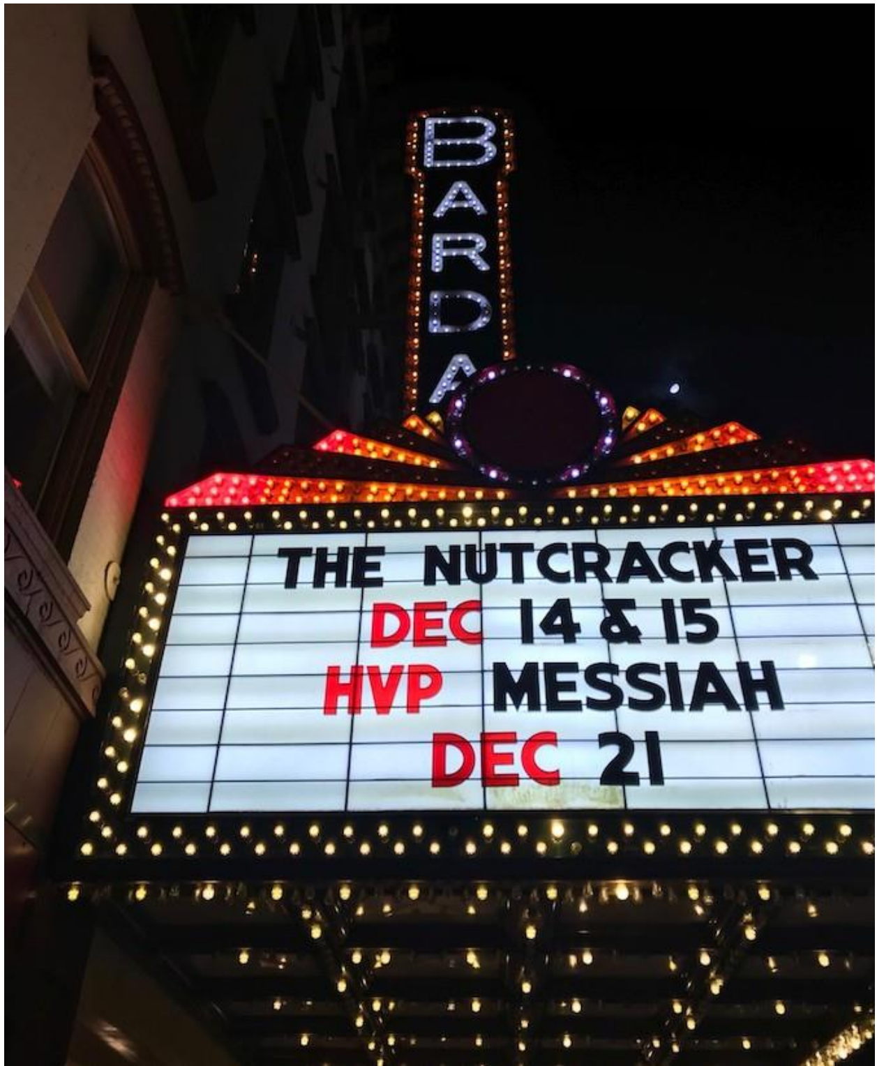
The Bardavon Marquee Our community has come to love and rely on this perennial favorite, Handel's Messiah